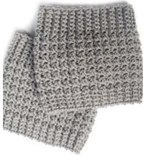
Comfy Squares textured boot cuffs